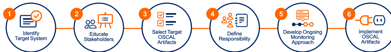
The Easy Dynamics 6-Step OSCAL Process

In 2021, NIST introduced a standardized approach to security compliance management with its release of the Open Security Controls Assessment Language (OSCAL) . To facilitate the journey to OSCAL adoption, Easy Dynamics has developed a comprehensive framework that describes a 6-step process – from selecting a target system to change management efforts – allowing organizations to develop and maintain highly-reusable compliance artifacts.